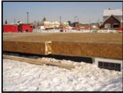
FIRST FLOOR GOING IN!