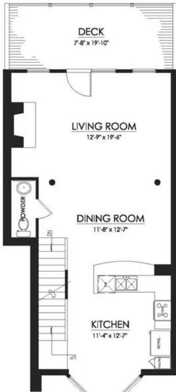
Second Level 715 sq. ft.