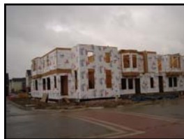
FRAMING IS UNDERWAY