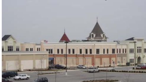
From Birkdale Guest Bedroom