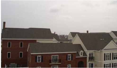
View from Dorset Roof Top Deck