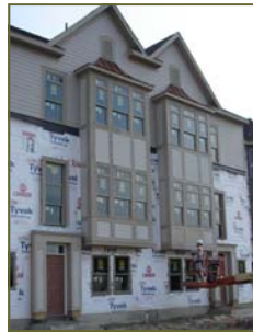
“Windows on the World”